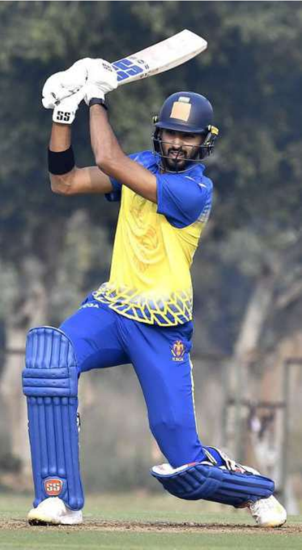
Free-flowing knock: Padikkal was in his element as he brought up his ninth List A century.