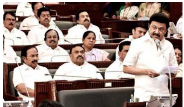
For timely justice: CM Stalin said a special committee headed by Additional Superintendent of Police will be formed to expedite trials in sexual assault cases in all the districts.

Rules, 1983, would be amended to ensure that persons accused in such cases were not granted bail, the Chief Minister added.