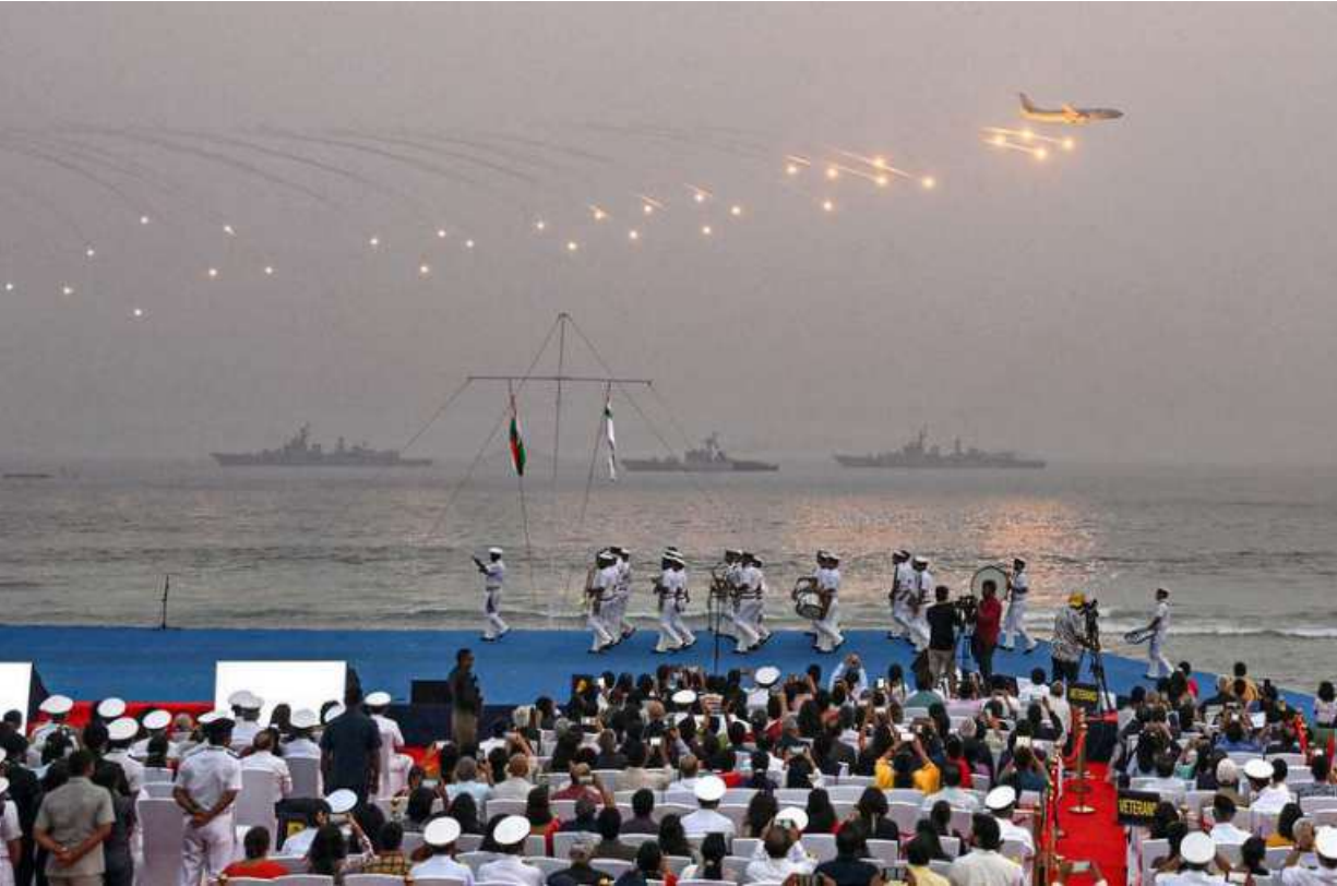
Leaving a mark: A Navy aircraft fires flares as it performs a fly-past.