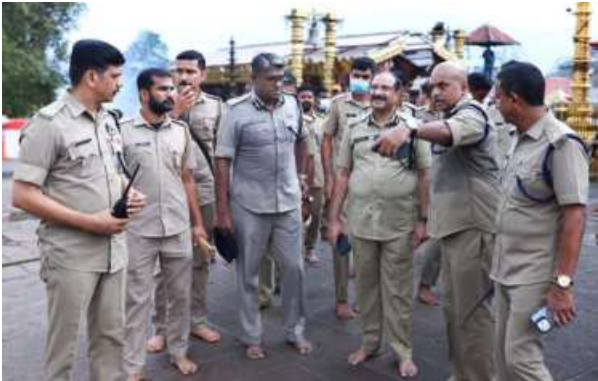
Taking stock: State police chief Sheikh Darvesh Sahib reviews the arrangements at Sabarimala on Saturday.

To ensure the safety of pilgrims flocking to Sabarimala to witness the celestial light Makarajyothi during the Makaravilakku festival, authorities have implemented extensive arrangements. Pathanamthitta District Collector S. Premkrishnan has announced strict limits on the number of devotees allowed at key viewpoints. Panjippara and Ilavunkal will each accommodate up to 1,000 pilgrims and Nelli-mala, 800. Attathode West will host 300 devotees and Attathode East, 2,500. The Pampa Hilltop, the largest viewing area, will hold 8,000 devotees. For safety reasons, entry to the Ay-