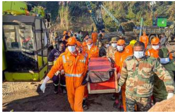
Long operation: A rescue team carries the body of a worker recovered from a mine in Dima Hasao, Assam on Saturday.