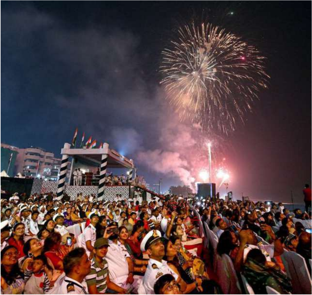
Visual treat: Naval officers with their families watch as fireworks go off during the demonstration.

landing in the sea. They were promptly rescued and brought back to the shore. Undeterred by the mishap, the team executed a flawless landing during the main event, earning cheers from the audience. A composite fly-past by Chetak helicopters, Hawk jets, and Dornier planes highlighted the synchronised operations of the naval air fleet. The evening concluded with a mesmerising beating retreat ceremony. Drone formations lit up the night sky, narrating tales of naval valour and technology. Fireworks and a laser show from the deck of a ship captivated the audience, culminating in firing of flares and illumination of naval vessels, casting a glow over the coast. The demonstration was a testament to the Indian Navy's operational excellence, resilience, and technological prowess.