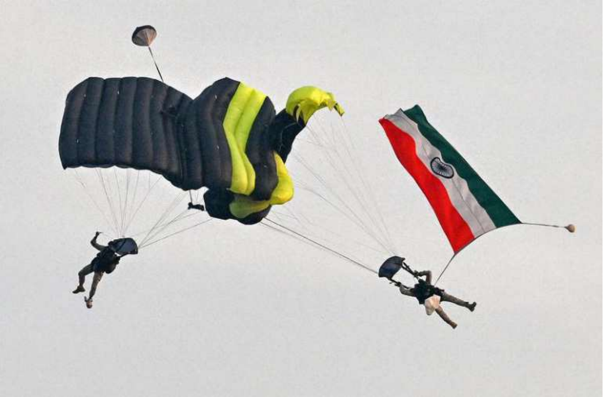
Close call: Two naval skydivers collide mid-air before safely landing in the sea during a rehearsal of the operational demonstration.