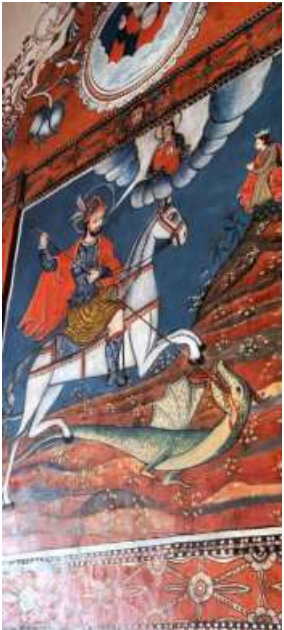
The mural of St. George and the dragon at the Kadamattam St. George Orthodox Church.