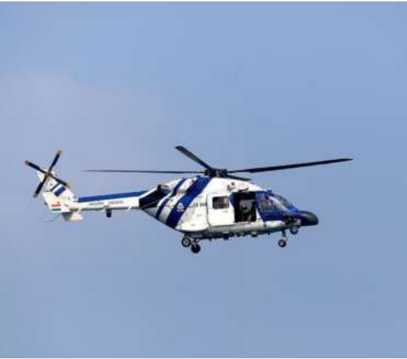
Precarious ride: There have been nearly 20 crashes involving the ALH over the past two decades.

An HAL spokesperson neither confirmed nor declined the advisory. The Border Security Force has six of these choppers in its fleet, and the Jharkhand government has at least one Dhruv helicopter. The HAL also handed one Dhruv to the Government of Mauritius in February