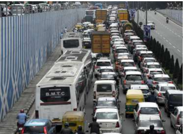
Rush hour: Bengaluru is notorious for its traffic jams that can leave drivers waiting on roads for hours.

Hyderabad (31.5 minutes) was the other Indian city in the top 20 globally,