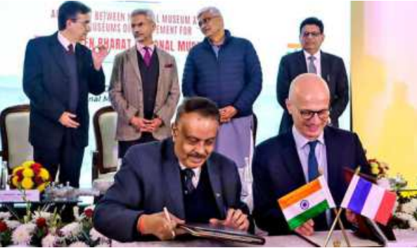
Plans made: India signed an agreement with France on December 19 last year for the development of the new museum.

India signed a memorandum of understanding with France on December