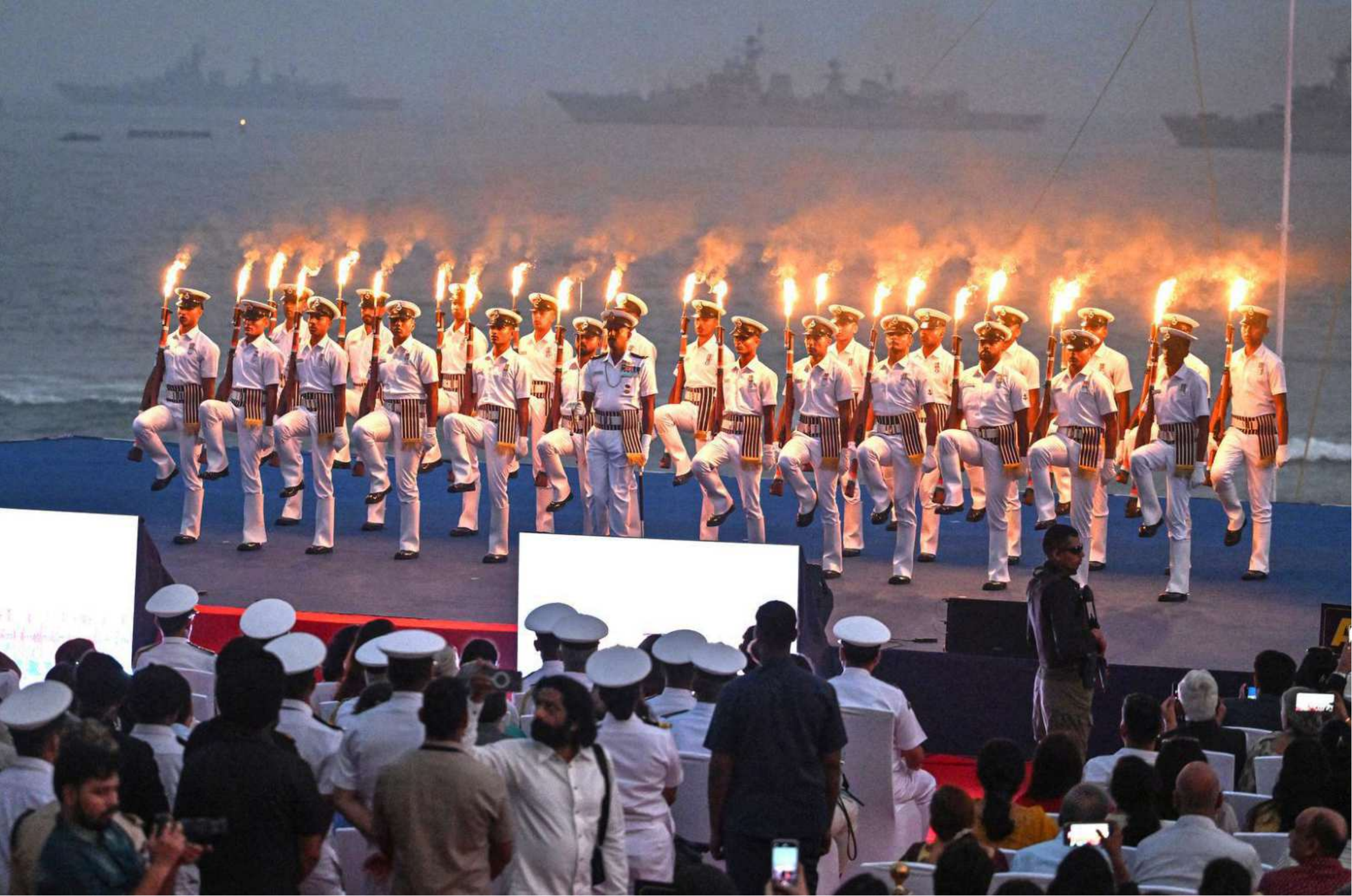
In sync: Indian Navy personnel perform a continuity drill during the Eastern Naval Command's operational demonstration in Visakhapatnam.