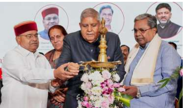
Vice-President Jagdeep Dhankhar inaugurating the 25th National Conference of Chairpersons of All-State PSCs in Bengaluru.

Vice-President Jagdeep Dhankhar has disfavoured extensions given to those in government services, saying such a step affected the prospects of those next in line. He said there have been cases where employees, particularly those in premier services, never seem to be retiring and continuing in service even after their superannuation, by getting some ad hoc positions. Delivering the inaugural address at the 25th National Conference of Chairpersons of All-State Public Service Commissions (PSCs) in Bengaluru on Saturday, he said, “Extension of service defies the logical principle of expectation. We have a doctrine of expecta-