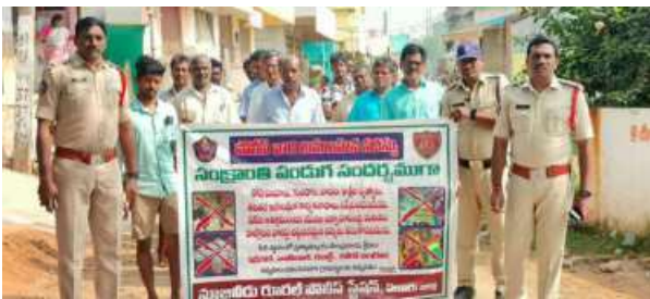
Police and villagers organising an awareness rally against rooster fights and other banned games in Eluru.