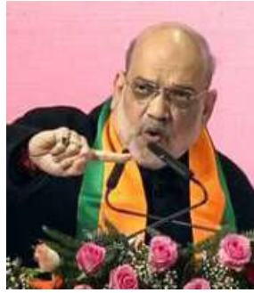
BJP leader Amit Shah at an event in Delhi on Saturday.

The Congress also hit out at the AAP chief, wondering whether Mr. Kejriwal, whom the Supreme Court granted bail last year in the liquor policy case subject to certain condi-