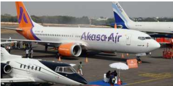
Problem of plenty: Akasa Air operates a fleet of 26 aircraft, but employs far more pilots than needed for its operations. FILE PHOTO

NLC India Ltd. on Saturday said its renewables arm has entered into a joint venture pact with Assam Power Distribution Company Ltd. (APDCL) for developing 1000 MW solar power projects in Assam. The pact has been signed between NLC India Renewables Ltd. (NIRL) and APDCL. While NIRL will have 51% stake in the JV, APDCL will have 49%. Power purchase pacts will be signed with Assam discoms for the sale of 100% of the generated power for 25 years.