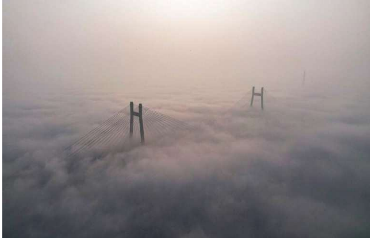
Under fog: The Naini bridge over the Yamuna in Prayagraj, Uttar Pradesh, shrouded in a blanket of dense fog on Saturday as severe cold weather continues in northern States.