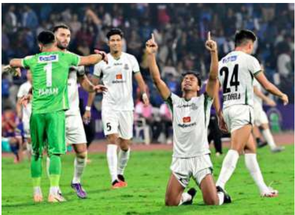
Job done: Mohammedan SC players are ecstatic after the final whistle.