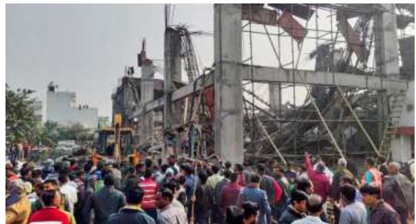
A rescue operation under way at the Kannauj railway station on Saturday. Seven persons suffer serious injuries.

A ceiling slab of the waiting hall suddenly collapsed. It is believed that nearly 40 people were present on the site at the time, of which at least 25 have