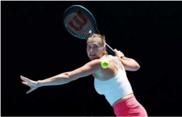
Gearing up: Sabalenka has been in red-hot form in the lead up to the tournament.

She has also been dominant in hardcourt Grand Slams in recent years, boasting a 27-1 record since the start of 2023.