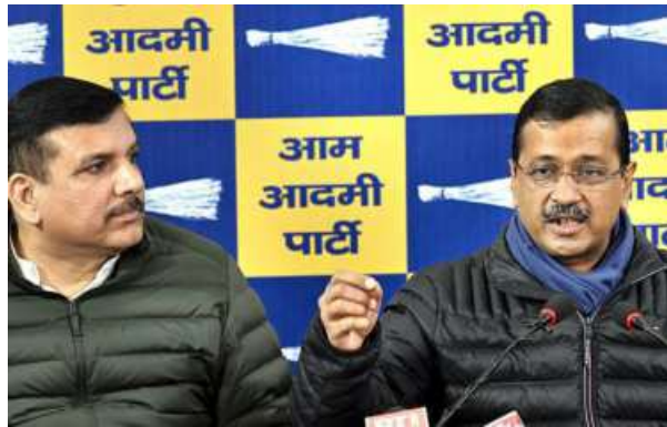
AAP's Rajya Sabha member Sanjay Singh and party chief Arvind Kejriwal addressing a press conference on Saturday.

At a press conference on Saturday, AAP Rajya Sabha member Sanjay Singh alleged that several voter registration applications using the residential