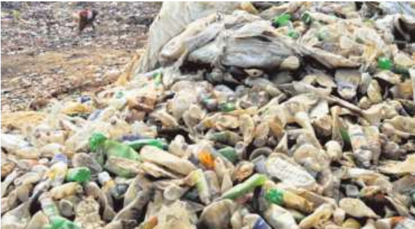
Enzyme production: The esterase enzyme is produced in large-scale by cloning the enzyme genes into E. coli bacteria.

■ In 2017, the team isolated another soil bacteria which use three enzymes in sequence to break down phthalates into carbon-dioxide and water