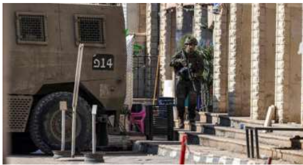
The Israeli military said on Friday that an internal inquiry found it likely that it killed two kibbutz residents as it fought Hamas militants during their October 7, 2023 attack. However, it added that “in both cases, it is not possible to determine with absolute certainty what caused the deaths”.