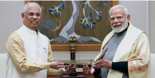
Courtesy call: Kerala Governor Rajendra Vishwanath Arlekar calls on Narendra Modi in New Delhi on Friday.

Kerala Governor Rajendra Vishwanath Arlekar has affirmed that Governors hold the final authority over matters concerning higher education in States, a position that has been supported by the University Grants Commission (UGC) and the judiciary on several occasions. His remarks come amid strong opposition from the LDF government regarding the UGC regulations of 2025. The controversy pertains particularly to the provisions granting the Chancellor greater powers in the appointment of