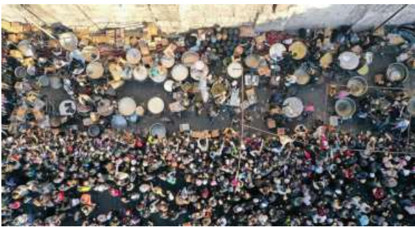
A stampede at the landmark Umayyad Mosque in Syria’s capital on Friday killed four persons, a Damascus health official told state media. Witnesses at the site of the stampede saw large crowds gathered near the mosque because free meals were being handed out. Sixteen persons were injured in the incident.