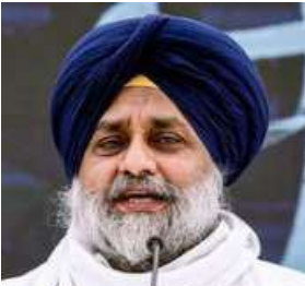
Sukhbir Singh Badal

The working committee of the Shiromani Akali Dal (SAD) on Friday accepted the resignation of Sukhbir Singh Badal from the post of party president, a move seen as a course correction aimed at reviving the century-old party which has been struggling to make a political comeback in Punjab.