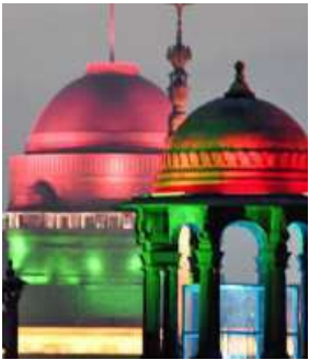
Invitees for the ‘At Home’ at Rashtrapati Bhavan will receive a specially curated box of craftwork from the five southern States.