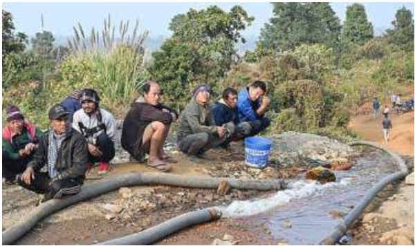
Residents waiting near a coal mine in Umrangso in Assam where miners got trapped on January 6. FILE PHOTO

The three mines were believed to have been abandoned before the National Green Tribunal