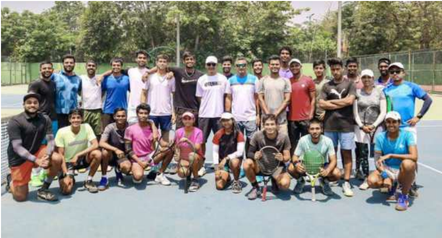
Sunrise to sunset: Players and coaches during good times at the National Tennis Centre in New Delhi.