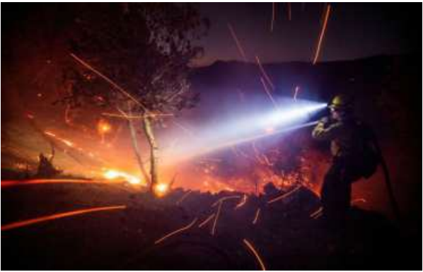
Killer blaze: A firefighter battles the fire in the Angeles National Forest in Altadena, California, on Thursday.

The fires, which have devastated Los Angeles neighbourhoods on the east and west sides of the city, have so far killed 10 persons and destroyed nearly 10,000 structures, with those figures only ex-