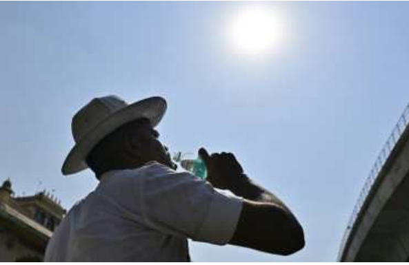
Scorching heat: Each of the past 10 years was one of the 10 warmest years on record.

Humanity has stepped into a future that climate scientists for decades have warned about. Temperature data made public on Friday by the Copernicus Climate Change Service (C3S), an authoritative source on historical trends in climate, show that 2024 was the first year in history when mean global temperature went 1.5 degrees Celsius above the pre-industrial level. Annual climate conferences, or the Conference of Parties convened by the United Nations, are about getting world leaders to agree on measures to curb emissions to keep temperatures from going over 2 degrees Celsius above the temperature in the 1850-1900 pre-industrial period and “as far as possible” keeping it below 1.5 degrees Celsius. Consistent rise The way climatological boundaries are determined, a single year in the red doesn’t by itself spell catastrophe. Only when temperatures consistently