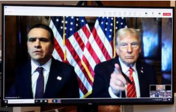
Case closed: Donald Trump and attorney Todd Blanche appear virtually before Judge Juan Merchan for the sentencing hearing.

A judge sentenced Donald Trump to an unconditional discharge on Friday for covering up hush money payments to a porn star despite the U.S. President-elect's efforts to avoid becoming the first felon in the White House. The judge spared Mr. Trump prison or a fine even though the 34 counts of falsifying business records on which he was convicted in May 2024 carried potential jail time. Instead New York judge Juan Merchan handed down the mildest criminal sanction available, an unconditional discharge — a relatively uncommon measure. "Never before has this court been presented with