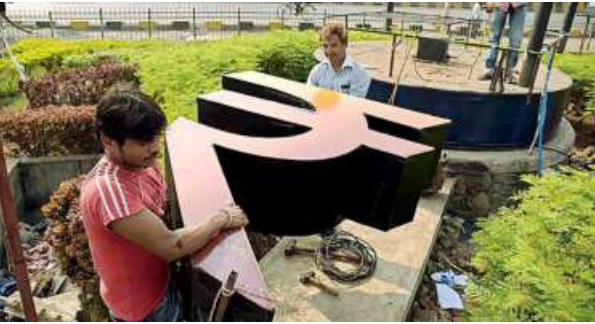
Currency crash: Weak tone in domestic markets and persistent FII outflows may keep putting downside pressure on rupee. FILE PHOTO

thened on increased demand amid the anticipation of restrictive trade measures by the new U.S. administration after Donald Trump takes over as