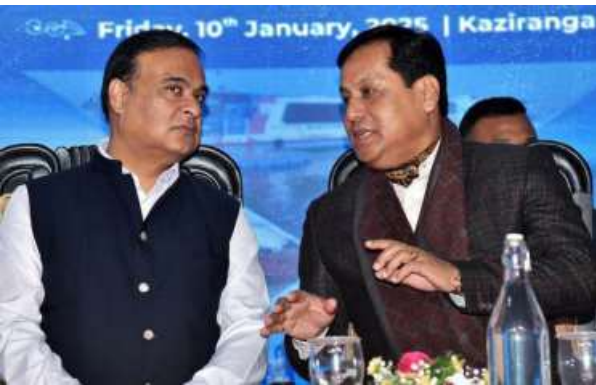
Assam CM Himanta Biswa Sarma with Union Minister Sarbananda Sonowal during the meeting of IWDC, at Kaziranga on Friday.

"Our rights have to be well-guarded and well-protected," Mr. Sonowal replied to a question from The Hindu on the issue of China's new dam. Officials in the know said that the exact nature and extent of the impact of the dam on India as a lower riparian nation has to be studied but it is bound to