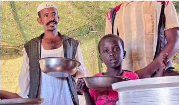
Dire straits: The UN said that around 7,72,000 children are expected to suffer from severe acute malnutrition.

Famine has already gripped five areas across Sudan, according to a report last month by the Integrated Food Security Phase Classification (IPC), a UN-