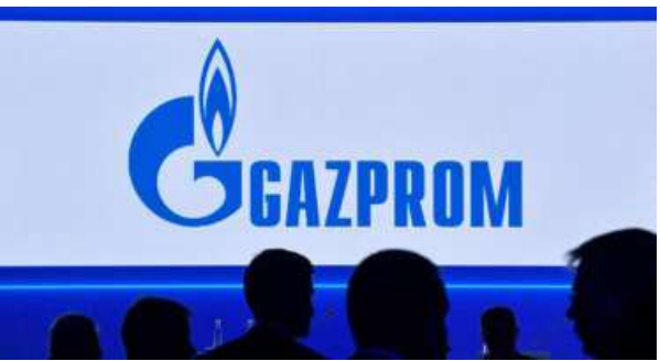
The U.S. announced widespread sanctions against Russia’s energy sector on Friday, designating more than 180 ships and two major oil companies just days before outgoing President Joe Biden leaves office. The U.S. Treasury Department added that the U.K. was also announcing sanctions against the country’s oil and gas sector.

The fires have so far destroyed nearly 10,000 structures, with the number only expected to grow; however, a pause in fierce winds have worked to the firefighters’ advantage; forecasters predict that strong gusts could return over the weekend