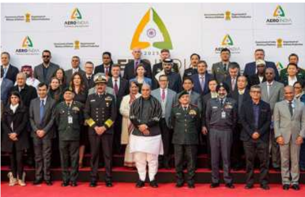
Defence Minister Rajnath Singh poses for a photo at Ambassadors' round-table, at Manekshaw Centre, New Delhi, on Friday.

Emerging as a leading voice for the Global South, India advocates for a multi-aligned policy approach that engages multiple stakeholders, which ensures that diverse views are considered in our collective pursuit of prosperity, Defence Minister Rajnath Singh said on Friday. He stated that India today can boast of having one of the largest defence industrial ecosystems in Asia and the country is committed to further enhancing existing capabilities.