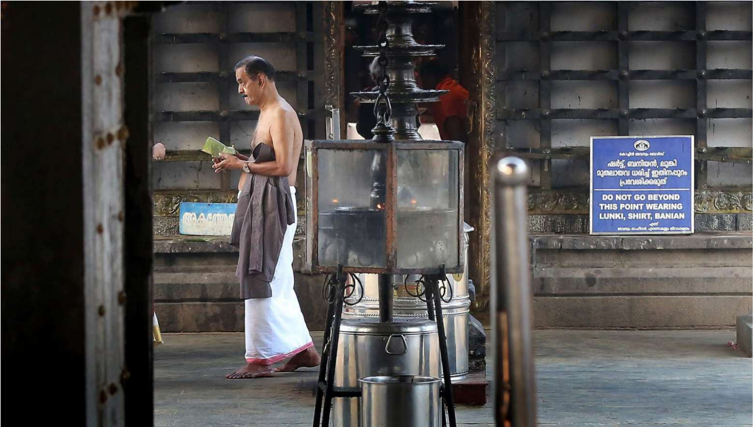
A devotee at the Siva Temple in Ernakulam.