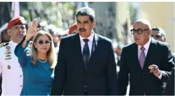
Venezuelan President Nicolás Maduro was sworn in for a third six-year term on Friday despite international condemnation of his recent re-election as illegitimate.. Aides to opposition leader María Corina Machado said she was briefly detained on Thursday following an anti-government demonstration in Caracas.