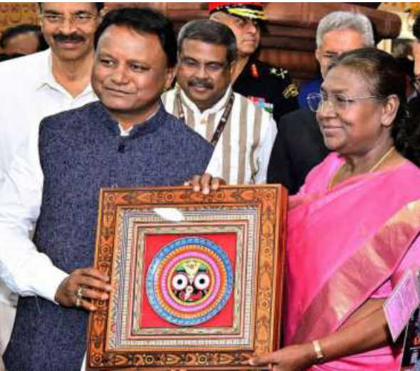
Odisha CM Mohan Charan Majhi welcomes Droupadi Murmu as she arrives at Janata Maidan in Bhubaneswar.

"As we celebrate the achievements of our Pravasi Bharatiya family, let us also look forward to the future with hope and determination. Together, we