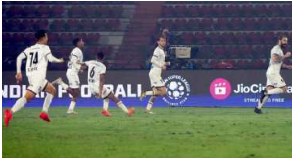
Late strike: Punjab FC players celebrate the equaliser.