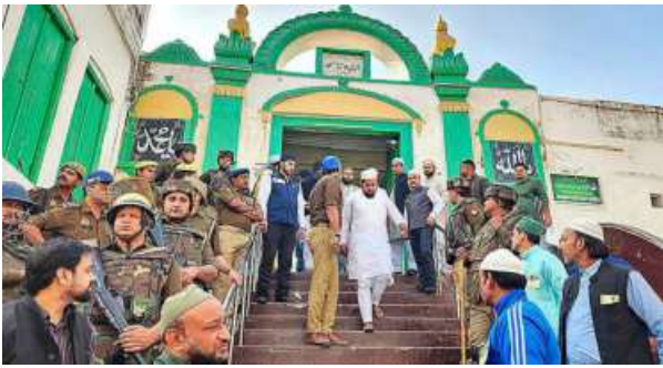
Under watch: Friday prayers happen under tight security at the Shahi Jama Masjid in Sambhal on Friday.