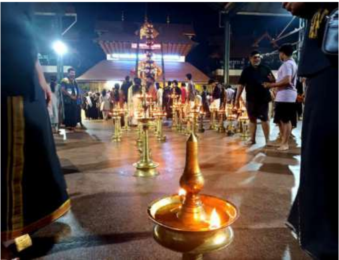
Visitors outside the premises of the Guruvayoor temple.